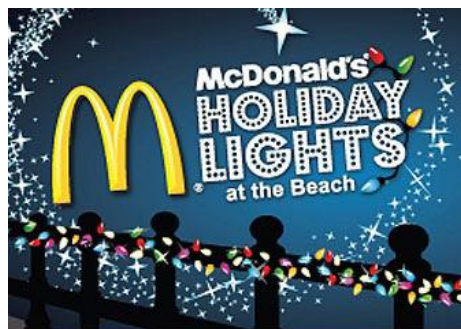
A nautical and holiday-themed light display at the Virginia Beach oceanfront!

PAMS PTA is selling Holiday Lights at the Beach tickets again this year. The lights are on display from November 22nd thru December 31st. Tickets are $8 each. Tickets sold at the gate are $12 Monday-Thursday and $15 Friday, Saturday and Sunday. This is a GREAT DEAL!!!! And for each ticket sold, Beach Events gives PAMS back $3!!! FREE MONEY! Fill out the order form at the end of this newsletter. Cash or checks (made out to PAMS PTA) accepted, and send it in with your child Attn: PTA .