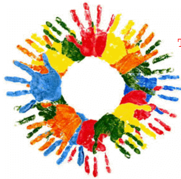
A Helping Hand Can Change the World

Lend-A-Hand Day to Benefit The Cerebral Palsy Foundation